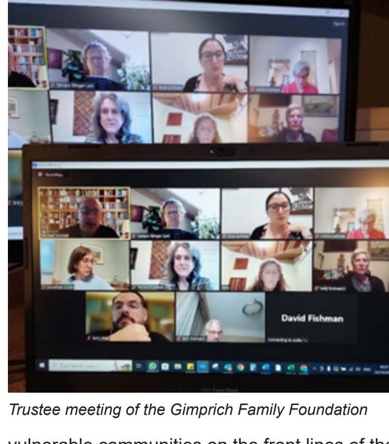
Trustee meeting of the Gimprich Family Foundation